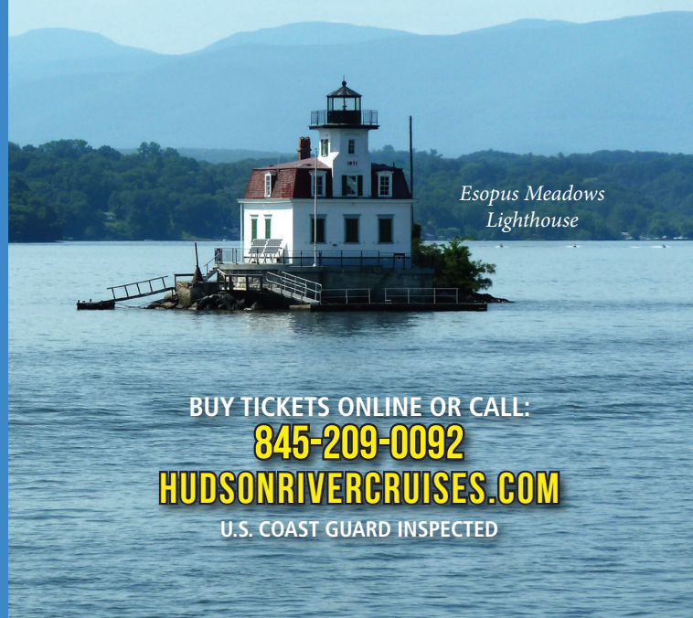
Esopus Meadows Lighthouse

Advance reservations are strongly recommended for all cruises.