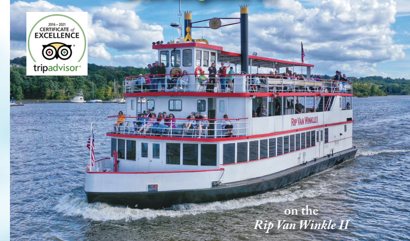
on the Rip Van Winkle II