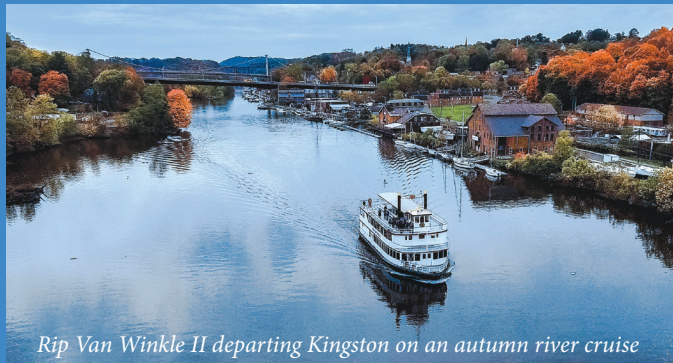
Rip Van Winkle II departing Kingston on an autumn river cruise

1 East Strand St., Kingston, NY (at historic Rondout Landing – see map inside)