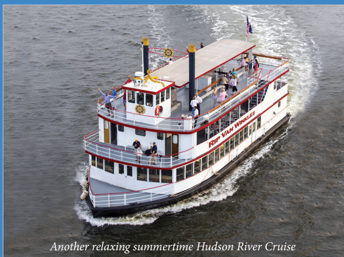
Another relaxing summertime Hudson River Cruise