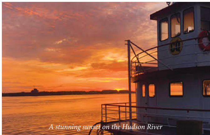
A stunning sunset on the Hudson River

On special summer evenings, the Rip Van Winkle II brings together music and the romance of the river under a canopy of stars. Our summer music cruises feature a variety of live music and DJs. Dance the night away or relax and listen to some great music!