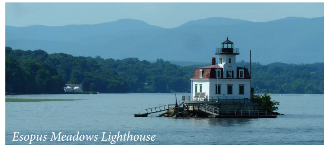
Esopus Meadows Lighthouse

The Rip Van Winkle II is available for private charters and events, and can accommodate up to 300 guests. Our sales professionals can help plan your perfect event, including catering, bar service, and DJs or live music. Rehearsal dinners, weddings, company outings, and family reunions are just a sample of what we offer! Email us at sales@HudsonRiverCruises.com for more info or call our offices.