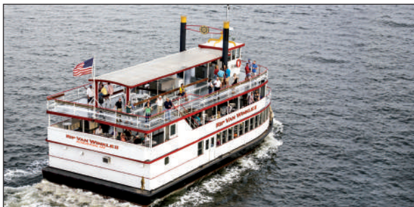
The Rip Van Winkle II cruises the Hudson River.