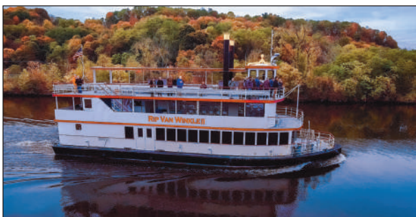
The Rip Van Winkle II is U.S. Coast Guard inspected.