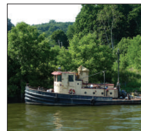
Tug boat along Rondout Creek