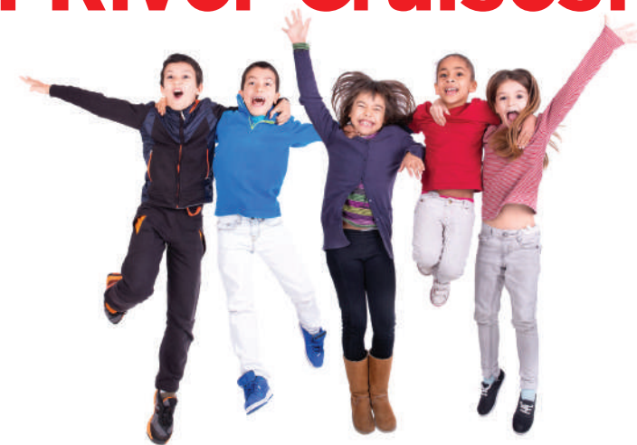
Students enjoy seeing many sights on our cruises...