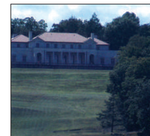
Col. Oliver H. Payne Estate