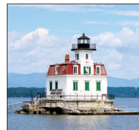
Esopus Meadows Lighthouse