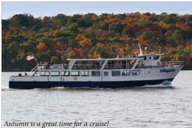
Autumn is a great time for a cruise!