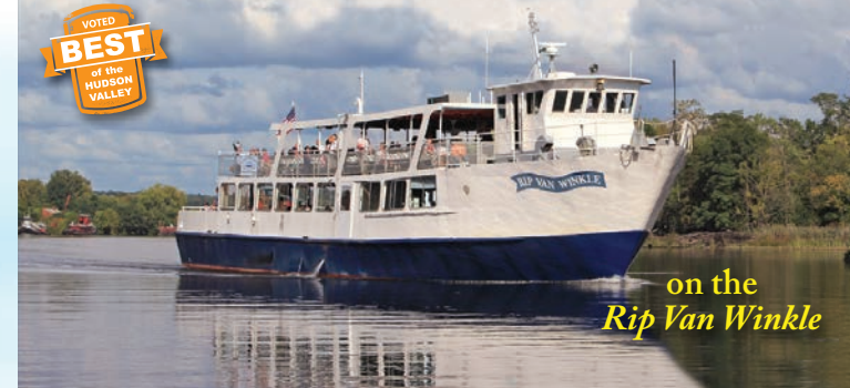
on the Rip Van Winkle