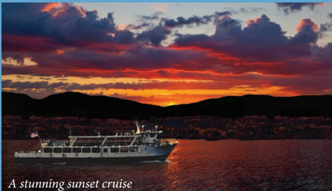
A stunning sunset cruise